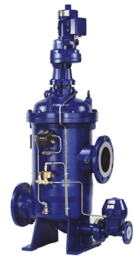
BOLLFILTER Automatic Type 6.18