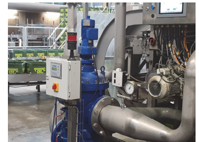
BOLLFILTER installed on crate washer